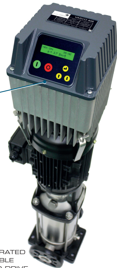
INTEGRATED VARIABLE SPEED DRIVE